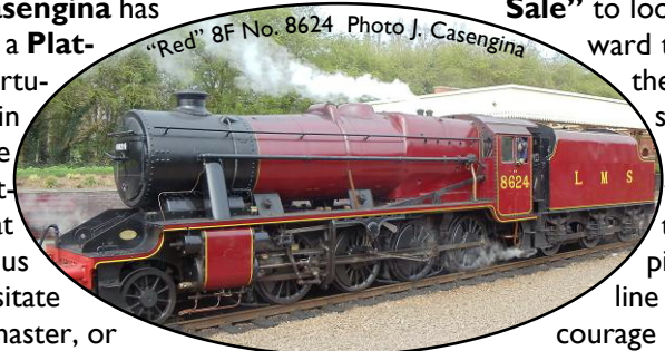
"Red" 8F No. 8624

Looking ahead we have the "Gr8 Escape Gala" and the "Great Easter Sale" to look forward to, so