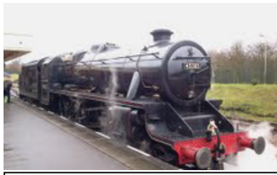
"Black 5" No. 45305

The accompanying photo of 4-6-0 "Black Five" No. 45305 taken on the same day was taken during one of the (much longer) wet spells.