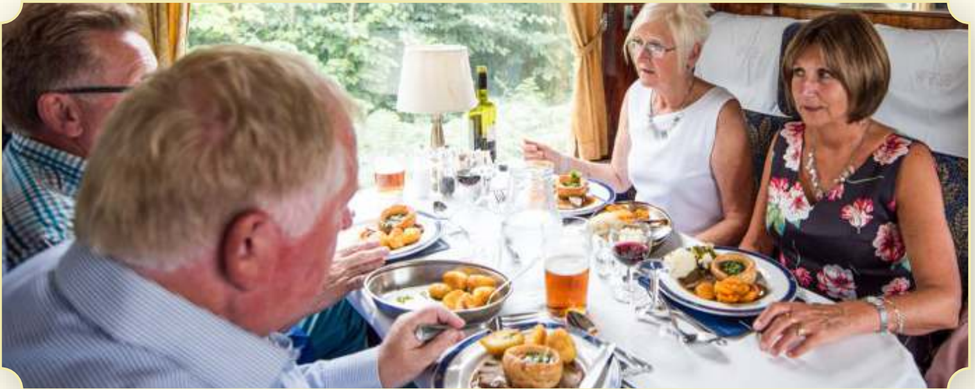
A SOCIAL OR FAMILY EXPERIENCE IN THE PULLMAN COACHES