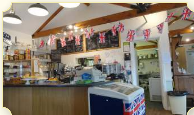
BUTLER HENDERSON CAFÉ - QUORN