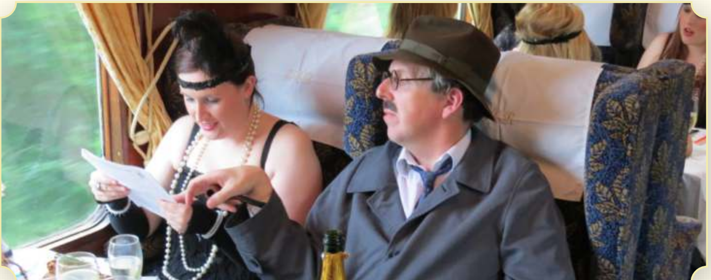
ONE OF THE ENJOYABLE AND EVENTFUL MURDER MYSTERY EVENINGS