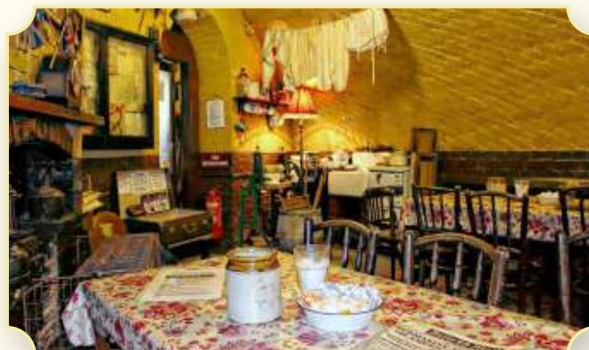
NAAFI-STYLE TEA ROOM - QUORN