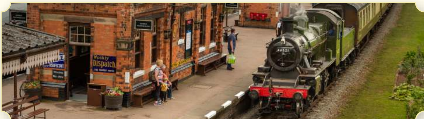
QUORN AND WOODHOUSE STATION - 1940'S ERA SETTING - CAFÉ - WAITING ROOMS