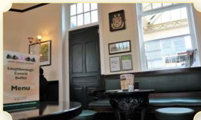
LOUGHBOROUGH REFRESHMENT ROOM