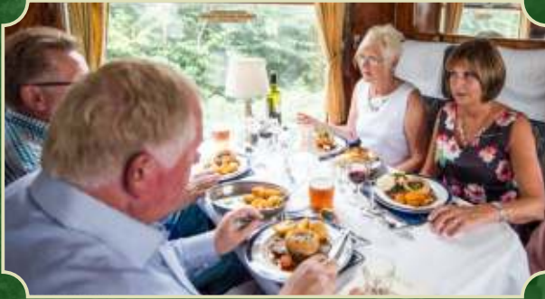
A SOCIAL OCCASION TO TREASURE