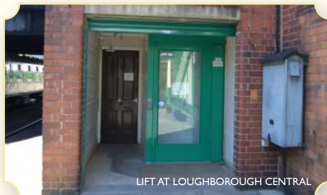
LIFT AT LOUGHBOROUGH CENTRAL