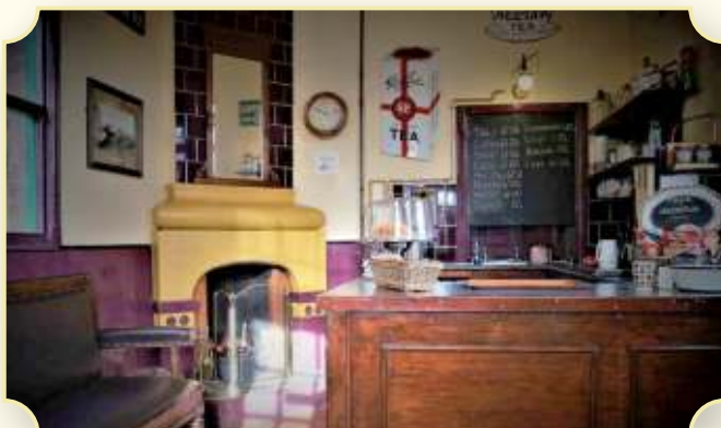
EDWARDIAN TEA ROOM - ROTHLEY