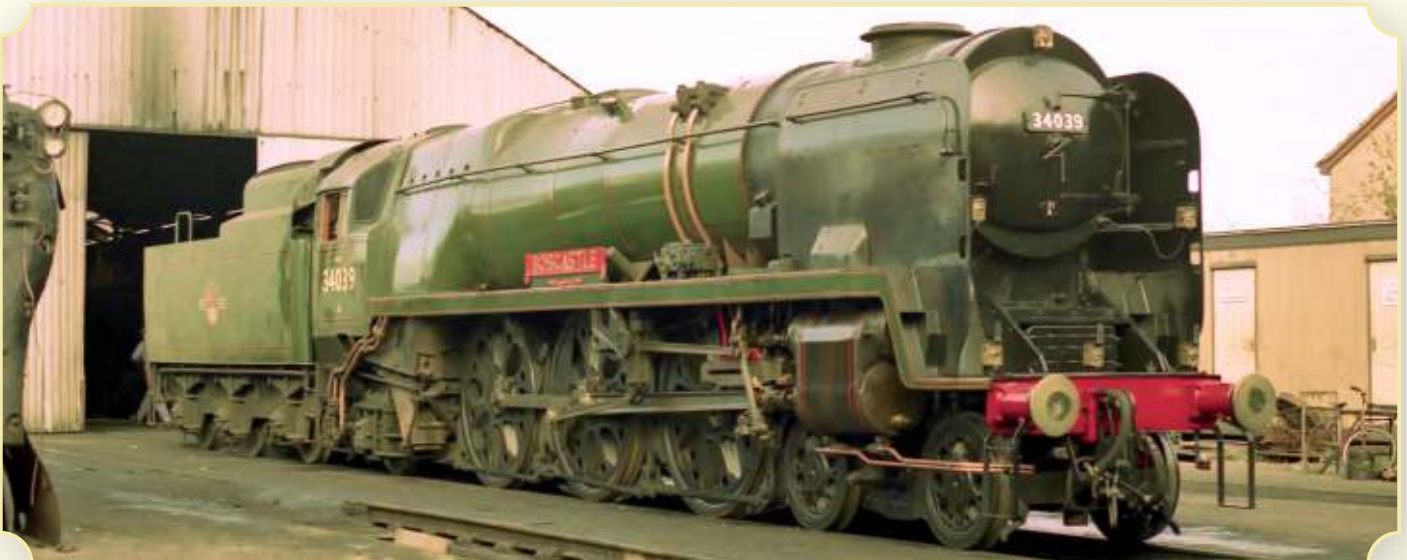
SOUTHERN RAILWAY WEST COUNTRY PACIFIC CLASS 34039 "BOSCASTLE" - BUILT 1946 - BRIGHTON