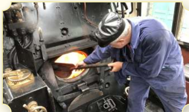
UNIQUE AND THRILLING EDUCATIONAL EXPERIENCES FOR ALL AT THE GCR