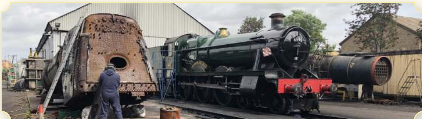
RAIL REGULATIONS DEMAND ALL STEAM LOCOMOTIVES BE TESTED TO SPECIFIC CRITERIA EVERY 10 YEARS