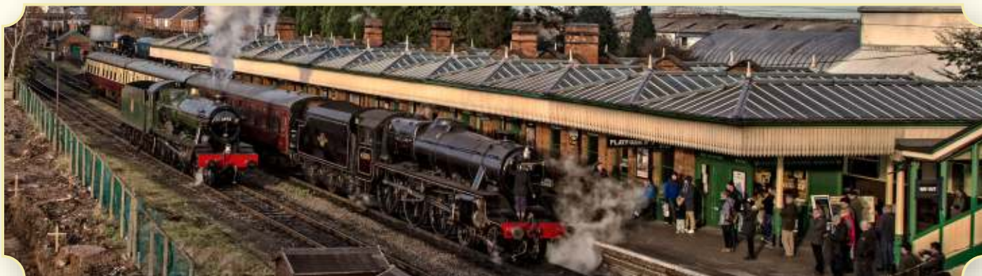
LOUGHBOROUGH CENTRAL STATION - CAFÉ - GIFT SHOP - MUSEUM - GALLERY