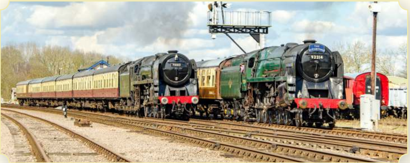
MANY LOCOMOTIVES AND INTENSIVE TIMETABLES DURING STEAM GALAS