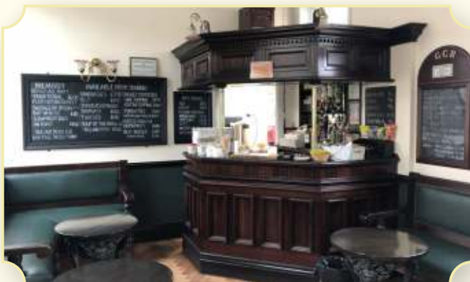
LOUGHBOROUGH REFRESHMENT ROOM