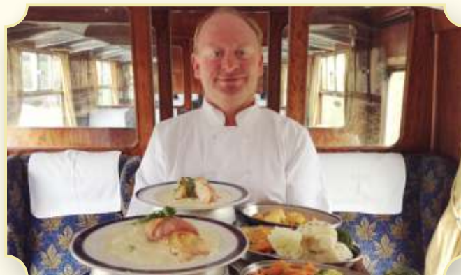
FIRST CLASS DINING TRAINS