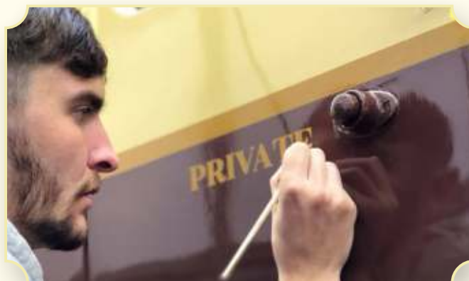
CARRIAGE & WAGON WORKS