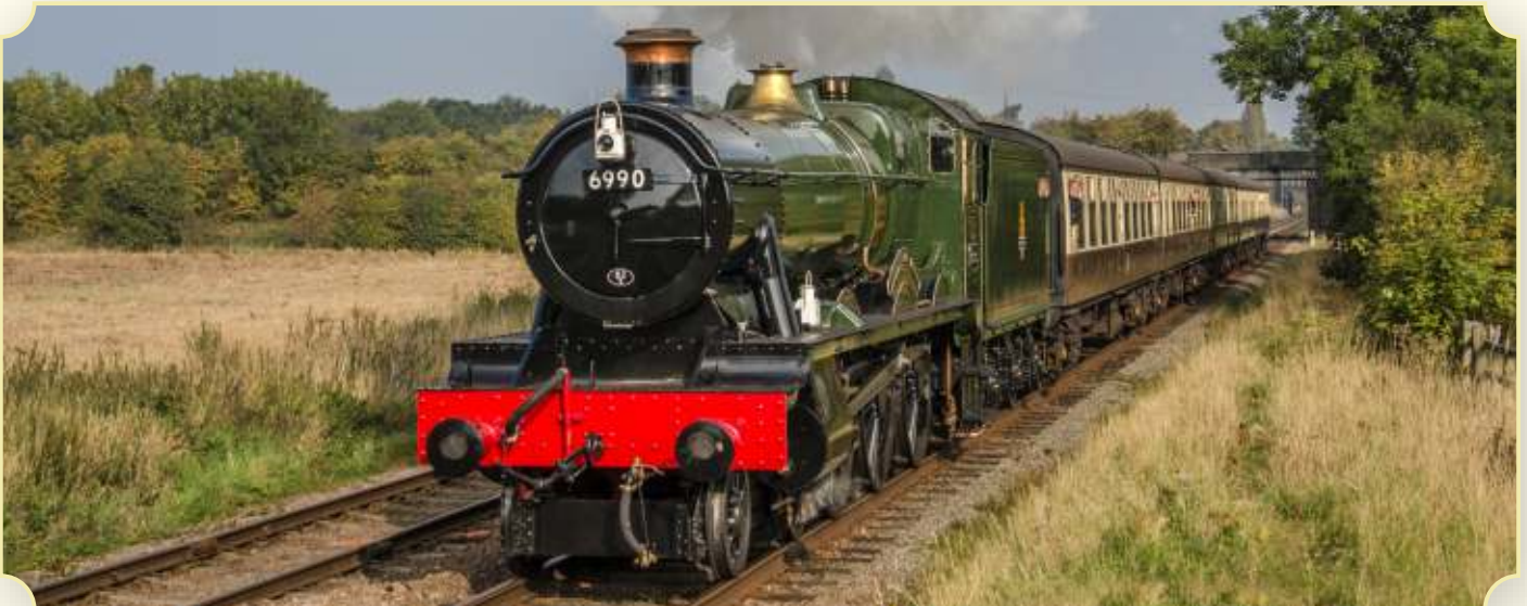
GWR MODIFIED HALL CLASS - 6990 "WITHERSLACK HALL" - BUILT 1948 - SWINDON