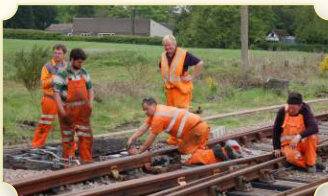
SIGNAL & TELEGRAPH / PERMANENT WAY