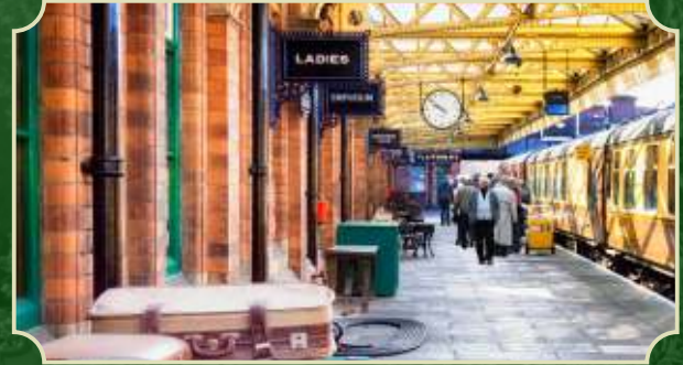
ORIGINAL HERITAGE STATIONS