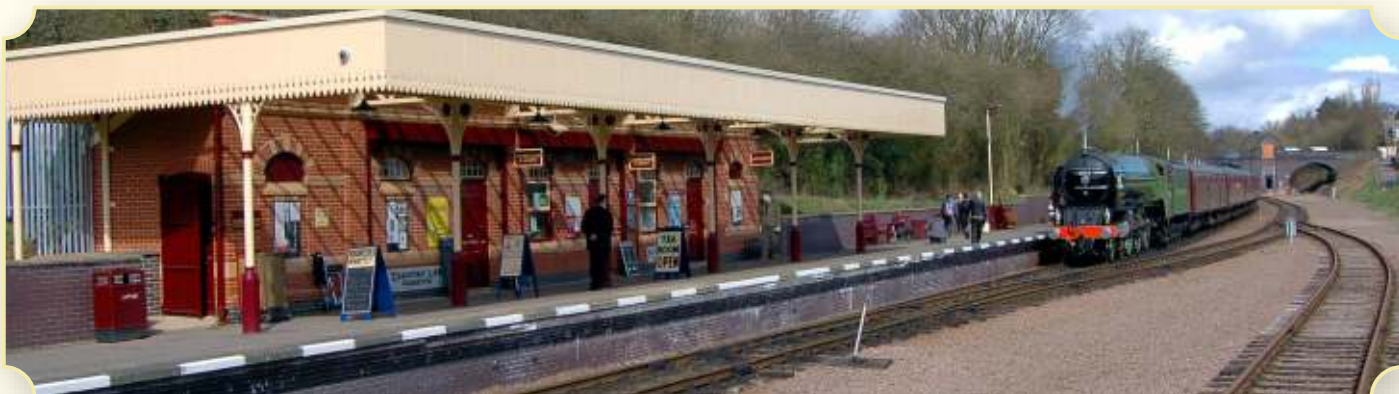
LEICESTER NORTH - 1960'S ERA SETTING - WAITING ROOM - TEA BAR