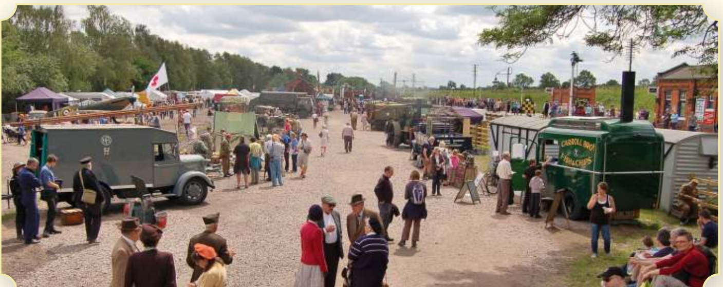
EXTRAORDINARY AND HISTORIC WARTIME WEEKENDS AT THE GREAT CENTRAL