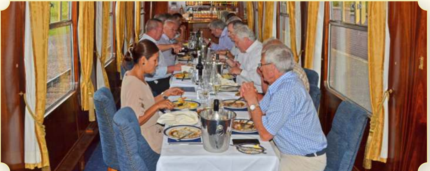
DINING WITH A REAL DIFFERENCE - OPEN-BACKED VERANDA COACH