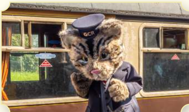
ENJOYMENT FOR ALL AGES