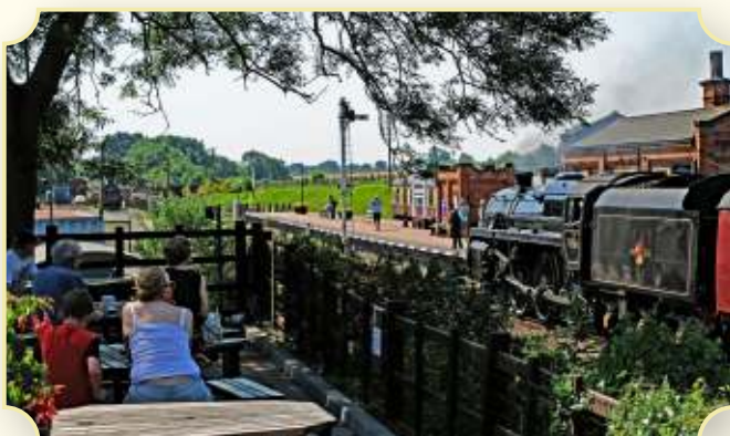
BUTLER HENDERSON CAFÉ - QUORN