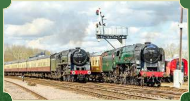
MANY HERITAGE STEAM LOCOMOTIVES