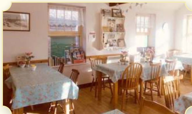
ELLIS TEA ROOM - ROTHLEY