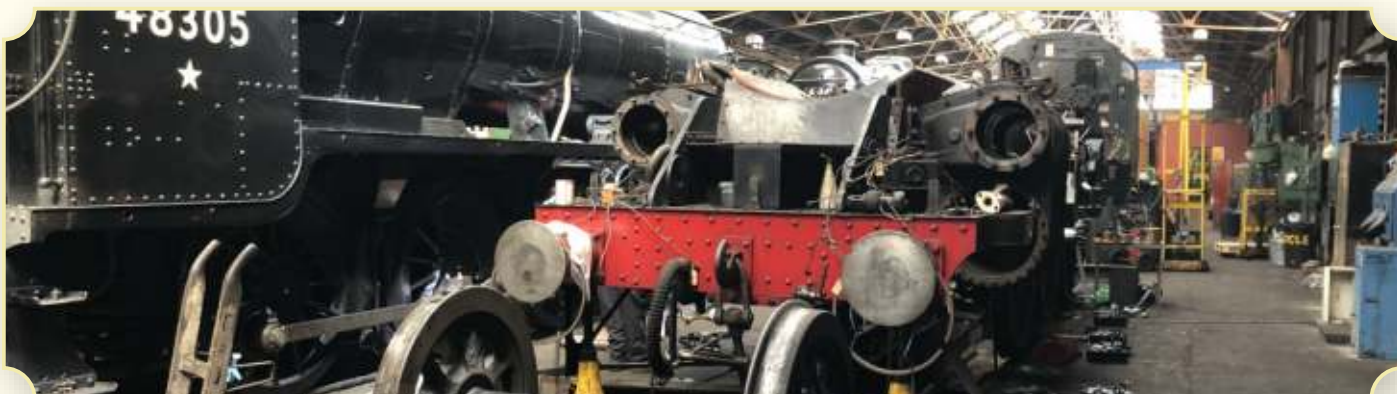
RAIL REGULATIONS DEMAND ALL STEAM LOCOMOTIVES REQUIRE A MAJOR OVERHAUL EVERY 10 YEARS