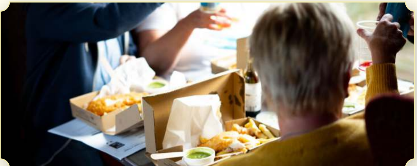
AN ENJOYABLE AND UNIQUE SOCIAL EVENT WITH A BUFFET OR PERHAPS A FISH AND CHIP SUPPER