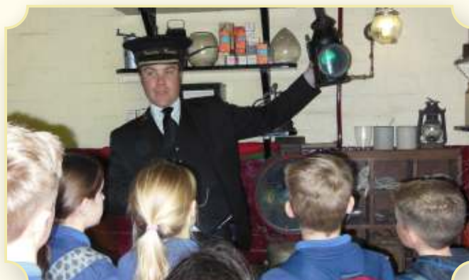
REGULAR HERITAGE RAILWAY EDUCATIONAL VISITS FOR THE LOCAL COMMUNITY