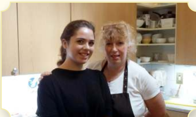
SOME OF OUR CAFÉ CATERING TEAM