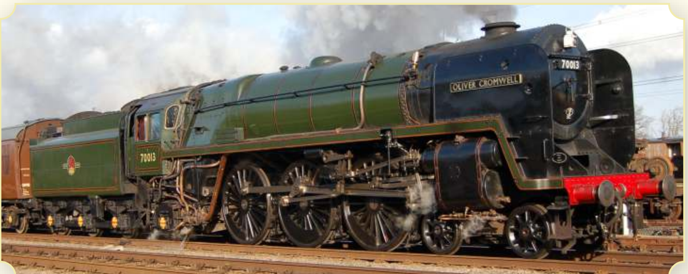
BR STANDARD CLASS 7 - 70013 "OLIVER CROMWELL" - BUILT 1951 - CREWE