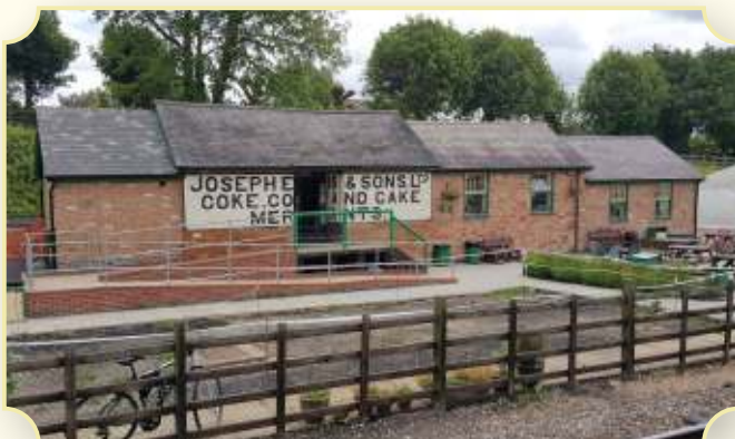
ELLIS TEA ROOM - ROTHLEY