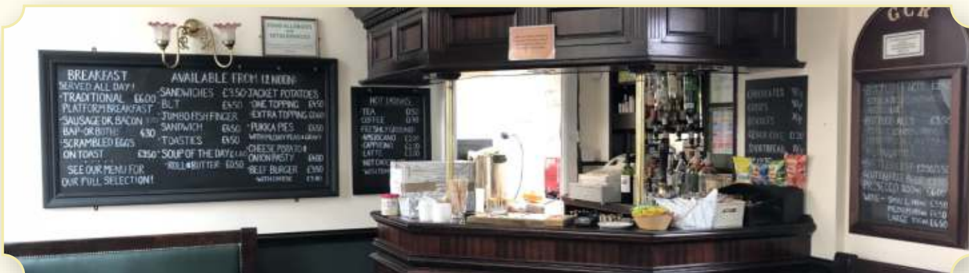
LOUGHBOROUGH - REFRESHMENT ROOM REFURBISHMENT - NEW EQUIPMENT AND NEW PLATFORM SEATING