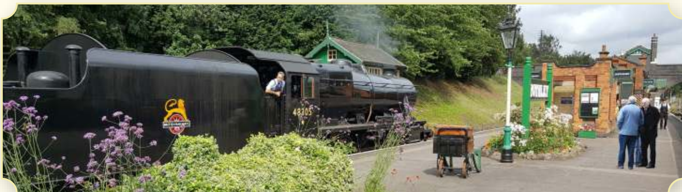
ROTHLEY STATION - 1912 ERA SETTING - CAFÉ - TEA ROOM - WAITING ROOM