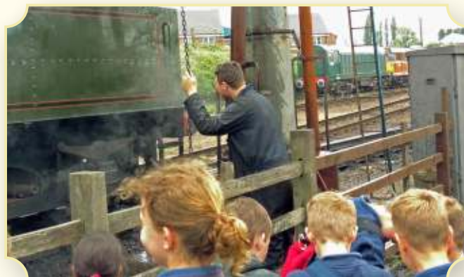
POSSIBLY THE FUTURE STAFF OR SUPPORTERS OF THE GREAT CENTRAL RAILWAY