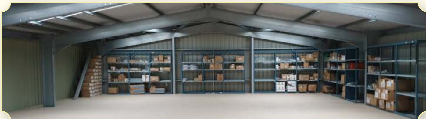
SWITHLAND - COACH AND SIGNAL & TELEGRAPH STORAGE FACILITIES