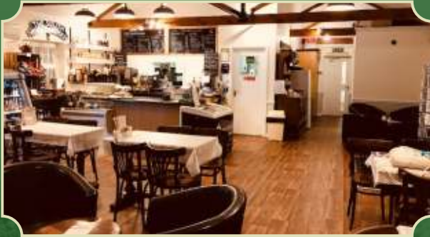
FOUR PLEASANT, SMART, COSY CAFÉS